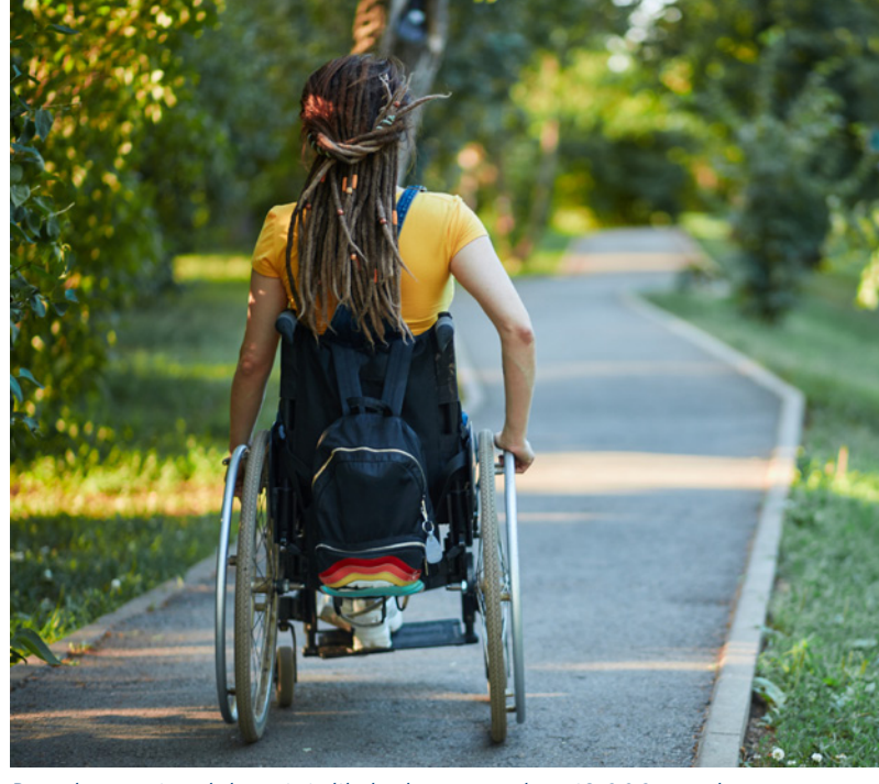
Based on national data, it is likely that more than 18,000 people are living with one or more disabilities in Guelph and Wellington County.

Data on the number of people living with disabilities in Guelph and Wellington County is not currently available. Based on national data, it is likely that more than 18,000 people are living with one or more disabilities in Guelph and Wellington County, and 7,200 of those have a more severe disability.