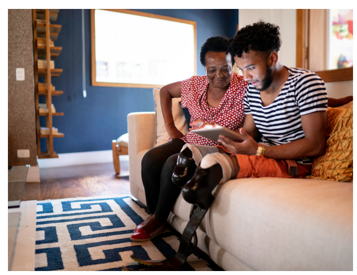
Online learning has been challenging for some students with disabilities and positive for others.

Information provided by Family Counselling and Support Services for Guelph-Wellington highlighted challenges some people with developmental disabilities face using a smartphone or navigating online banking to pay bills. At periods in the pandemic when banks were not open this challenge was heightened.<sup>7,45</sup>