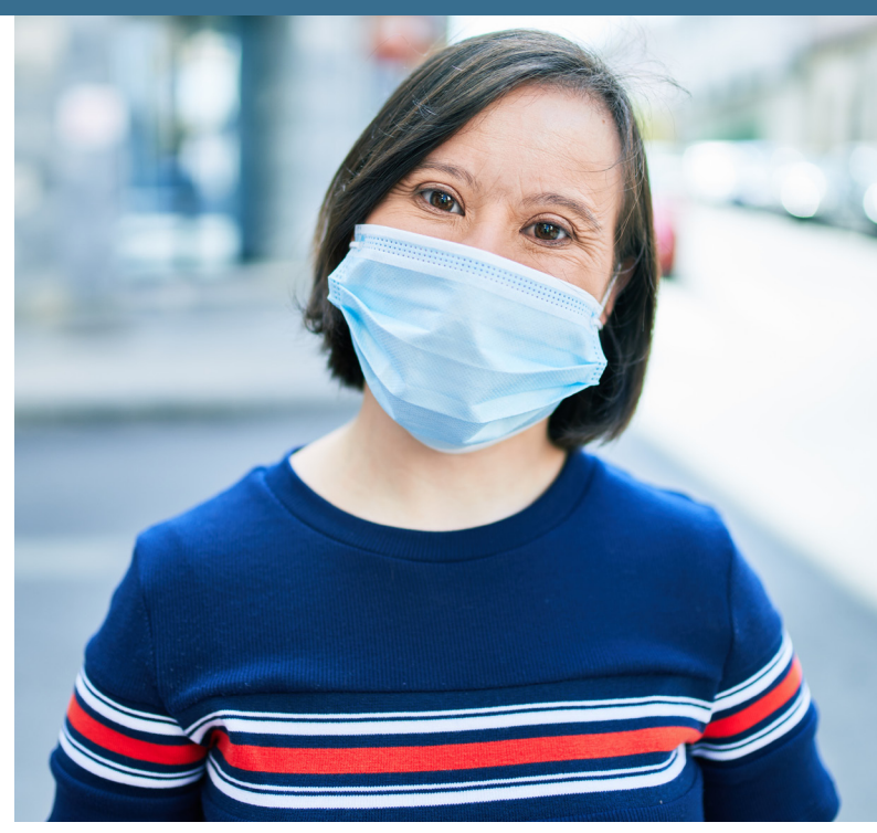
Wearing a mask can be difficult for some people with disabilities.

Job loss and financial issues are often associated with an increase in family conflict, marital instability, and emotional distress.<sup>7,8</sup>