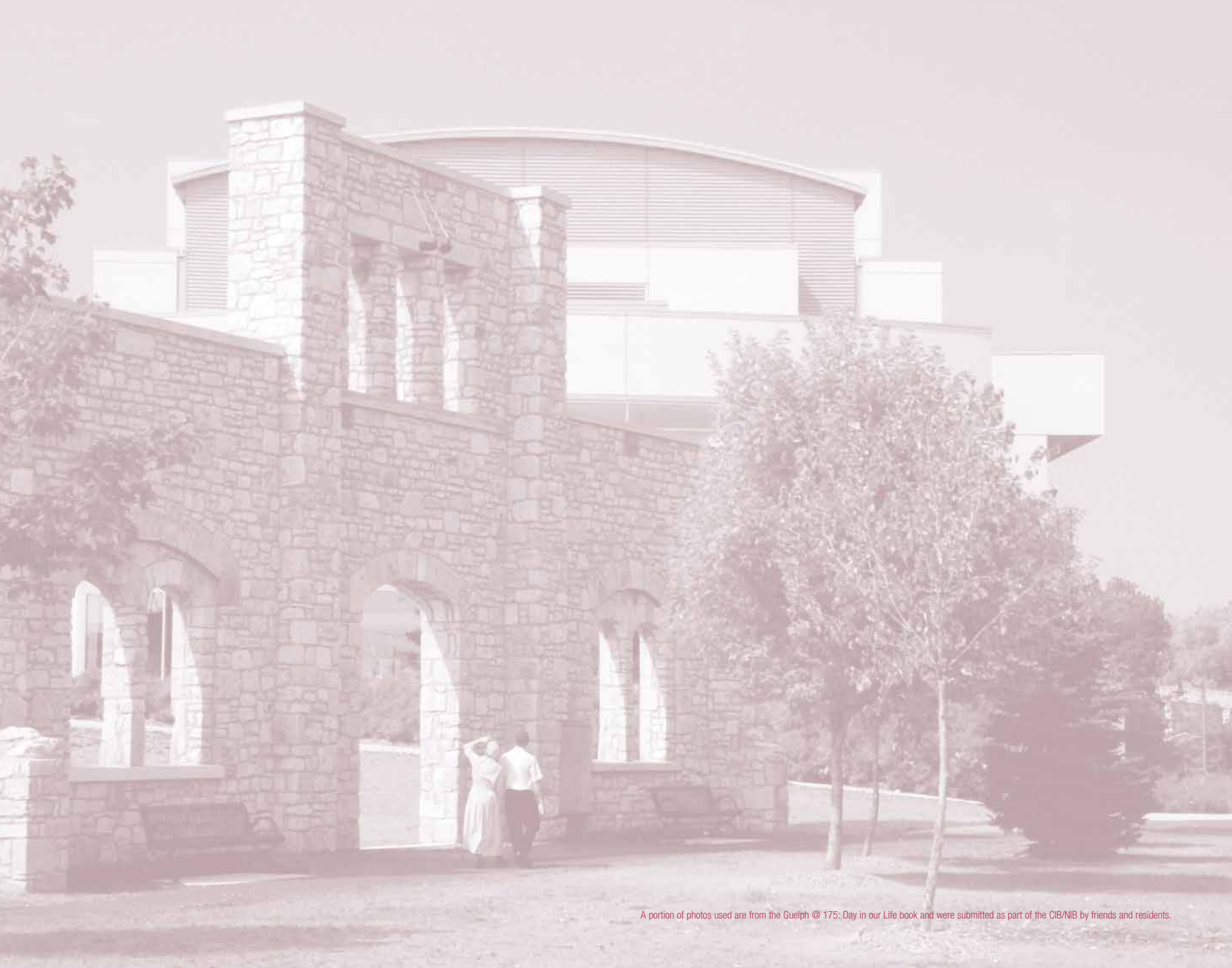
A portion of photos used are from the Guelph @ 175: Day in our Life book and were submitted as part of the CIB/NIB by friends and residents.